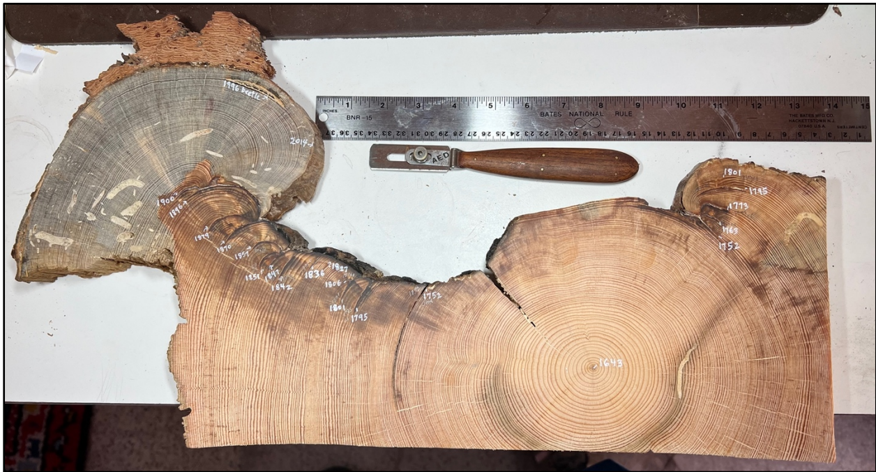
Figure 2. The re-sectioned Horseshoe Springs sample showing 17 different fire scar dates. Pith date 1643, bark date 2014. In addition to the fire scars, a pitch pocket that was probably caused by a failed bark beetle attack is visible in the left lobe of the healing curl in the 1996 tree ring.

After cutting the section, it was possible to see at least 8 more fire scars that were completely grown over by ring growth.